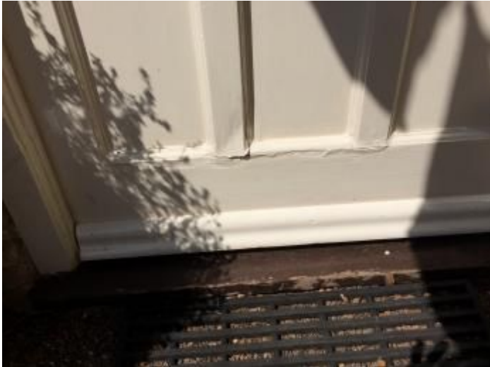
Door threshold and step down into kitchen