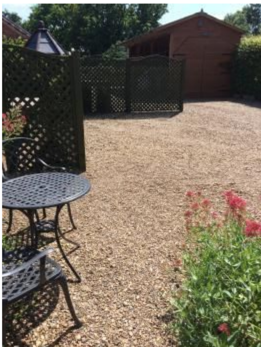
Car parking are for Bay Tree Cottage and for Horseshoe Cottage, with space for 3 small cars or 2 larger cars