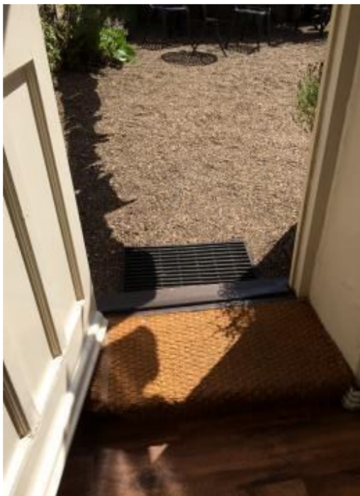
Step down into kitchen, 12 cms