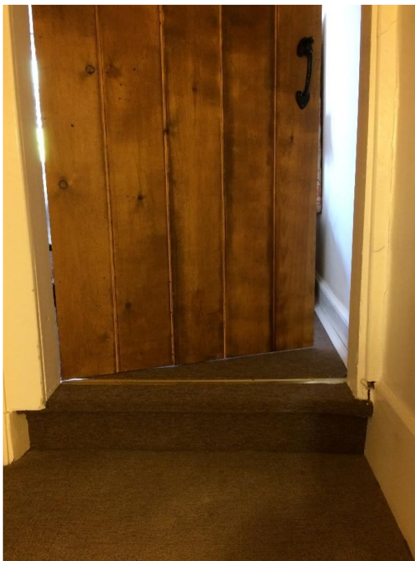
Step up into bedroom is 16cms