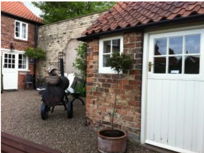
Courtyard garden at Bay Tree Cottage and outside Laundry