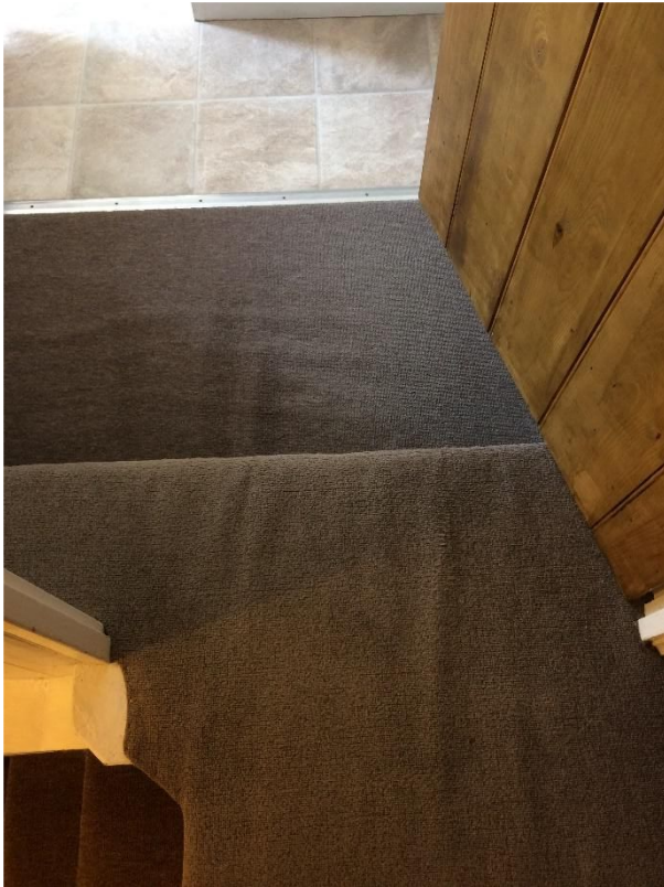
The bedroom door is 79 cms wide.