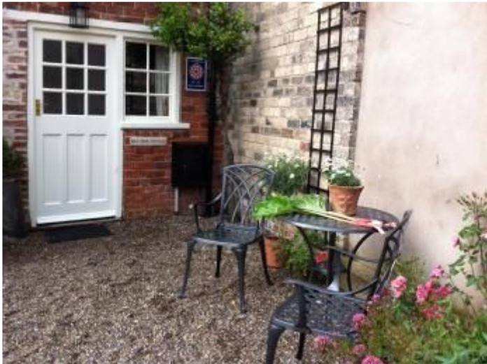
Outdoor area and courtyard garden at Bay Tree Cottage