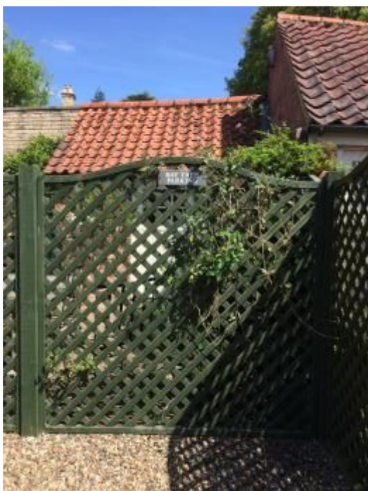
Alloted car park spot at Bay Tree Cottage